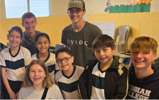
A youth team serving churches and schools in Guatemala

How does DOVE USA Missions impact the world?