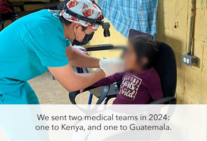
We sent two medical teams in 2024: one to Kenya, and one to Guatemala.

DOVE USA missionaries are located around the globe!